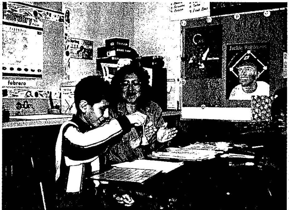
Math success becomes a group experience when the class stops to applaud a student's mastery of the multiplication tables.