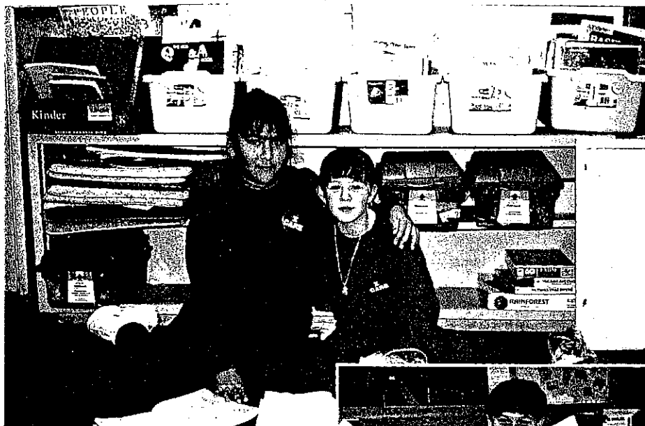
Third graders help each other with math; a classmate rings a bell to announce his academic achievement to the whole group.

The first child's answer was typical of the associations encouraged in collectivistic cultures, where objects are most meaningful when they are used in connection with social interactions. However, the teacher expected students to describe eggs as isolated physical entities and did not value the object as a connection among people in social relationships.